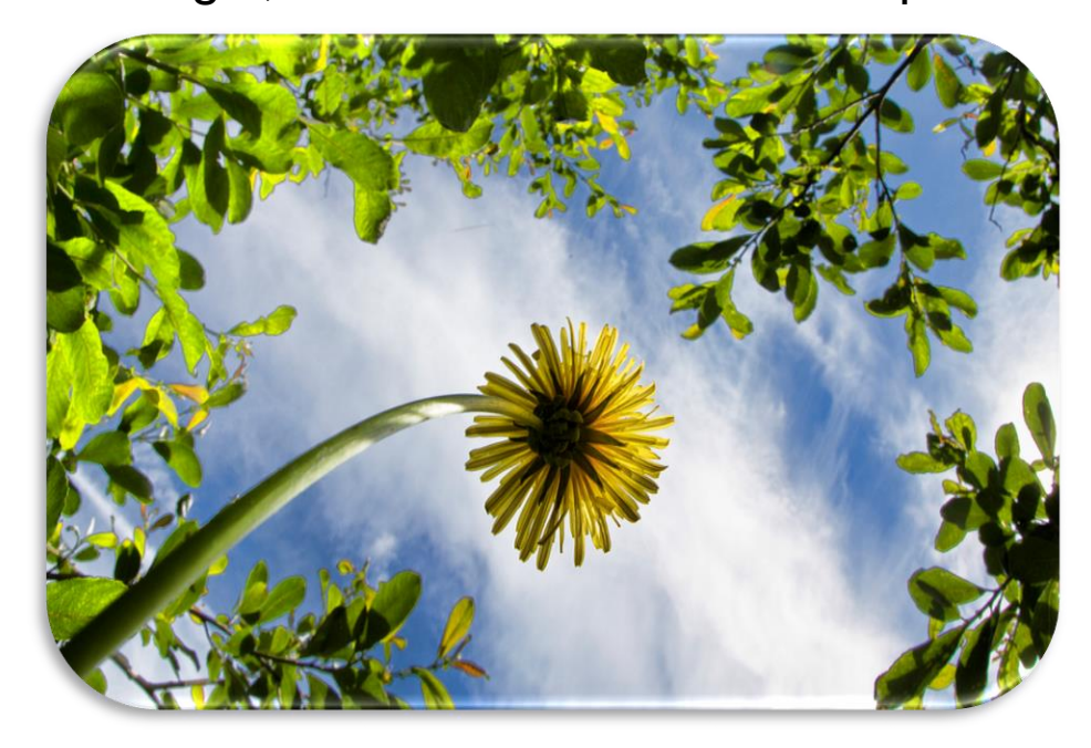
Which features does this photograph use?

Different viewpoints can make your image more interesting. Consider and try different angles, instead of just at usual eye level. For example, you could try; sitting at ground level, from high up (safely), from behind, at a side angle, from a distance or close up.